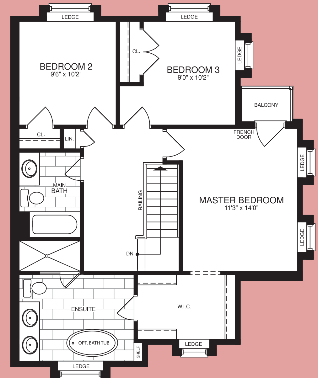
THIRD FLOOR PLAN ELEVATION A