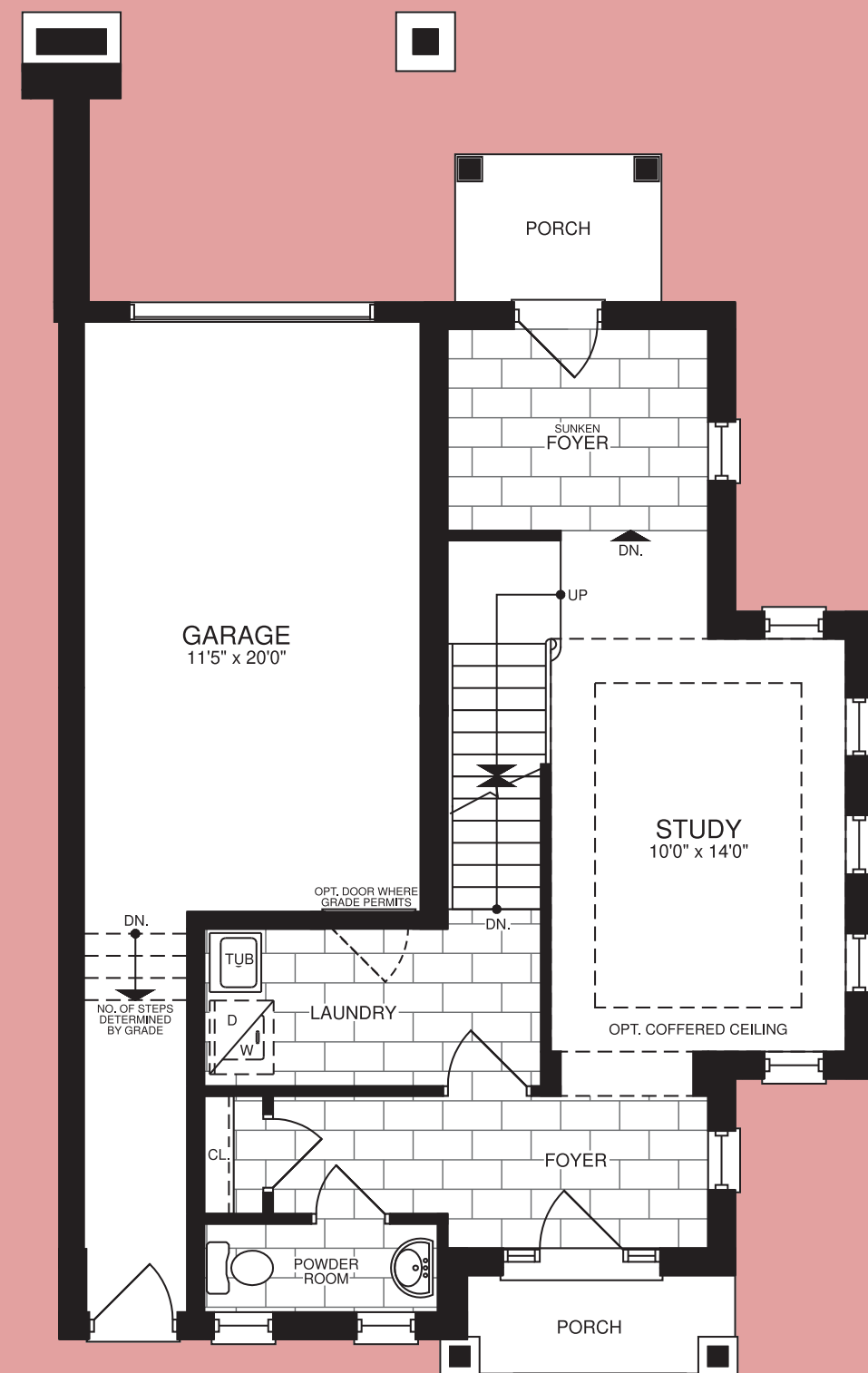
FIRST FLOOR PLAN ELEVATION A